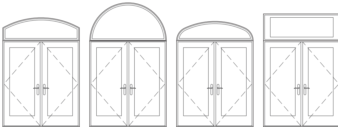
Arch Head over Double Half Circle over Double Elliptical over Double Transom over Double