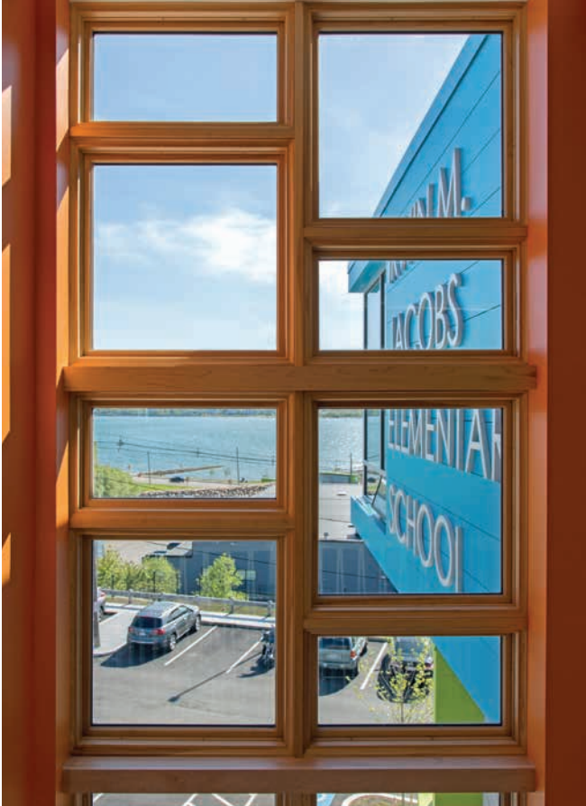
Traditional Fixed Awning and Casement, Fixed Frame Direct Set, Laminated Impact Glazing