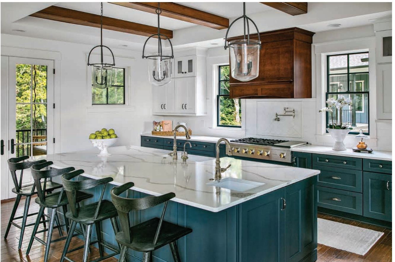
Southern Living Custom Builder home Lifestyle windows Pella® Lifestyle Series, Fixed, Double-Hung, Hinged Patio Door